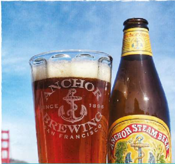
ANCHOR STEAM CRAFT BEER